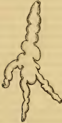
Outline of an abnormally enlarged biliary duct. Nat. size.

rassed, inasmuch as Mr. Murray had also kindly sent a large number of birds for dissection (Guillemots, Gulls, and a Parrot-beaked Awk) at the same time. I may yet further supplement the originally published record by stating that, when the ducts lying immediately below the surface of the liver were dissected out, they presented a distinctly beaded appearance, the successive enlargements of the lumen of the ducts being occupied by flukes closely packed together. At least twenty were found in one spot. As no figure of these abnormal ducts was published, I subjoin an outline which is an exact reproduction of a sketch I made in my note-book during the dissection. Unfortunately the actual thickness of the walls of the ducts was not represented; but, from recollection, I can state that it was considerable.